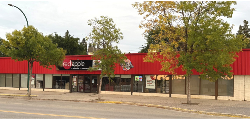
The former Bargain Shop gets a facelift over to Red Apple back in June