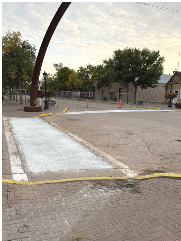
Coco paving was contracted by the RM of Russell-Binscarth to replace the crumbling crosswalks on Main Street. A total of 16 crosswalks at 4 intersections were replaced with concrete, providing a much-needed repair for pedestrians and drivers too!