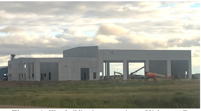
The new Ag West building in construction on Highway 16 E