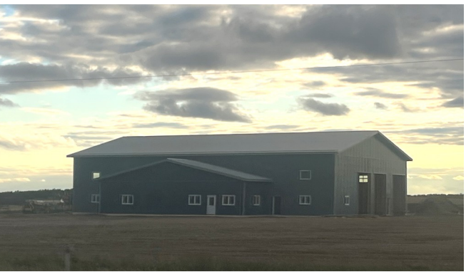
The new Chipelski Transport building in construction on Highway 16 E