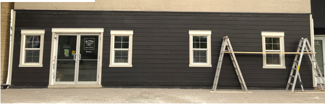
Caleb & Becca's Youth Centre's new storefront

construction (pictured page 2). With continued expansion of the Russell Inn with more rooms and adding a brand name restaurant we can be assured that we are well positioning ourselves for the future.