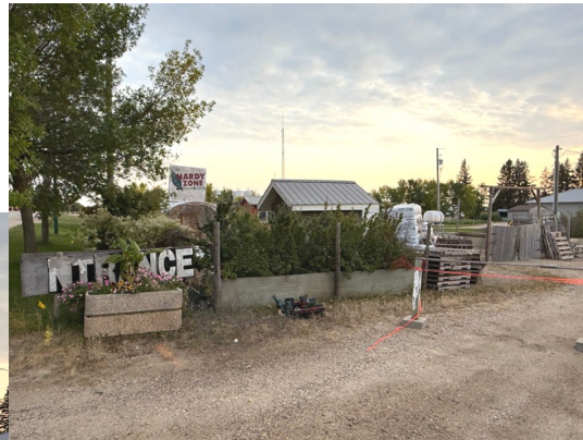
TinHouse Greenhouse. You'll find them hard at work on most evenings as they began renovations preparing for their official opening for the 2026 gardening season.