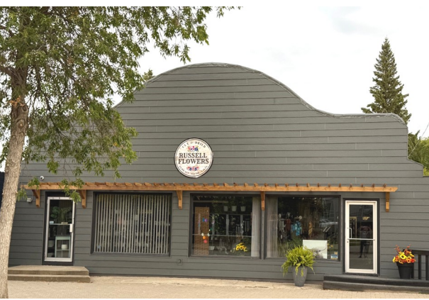
Russell Flower's new storefront - love the pergola!

We have worked so hard for decades as a company to fund development and push for the beautification of Main Street. All of the initiatives we push is so that Russell becomes the regional centre and it is evolving into that. If you look at all the towns in the region with some looking pretty tough and losing their health care services, Russell is the opposite. We have a potash mine, Bunge is expanding, we have a new Ag dealership going up on the highway, a state-of-the-art cancer care centre and dialysis unit. We understand a new office centre for the health district may be opening as well which further positions Russell as the regional centre.